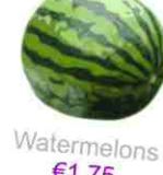
Watermelons €1.75 each