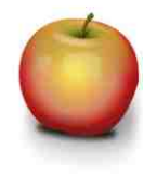
Apples 95¢ each