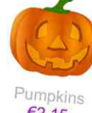
Pumpkins €2.15 each