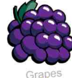
Grapes €1 per bunch