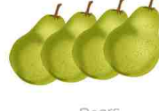
Pears €1 bag of 4