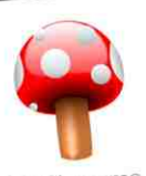
Mushrooms 5¢ each