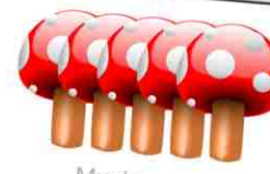
Mushrooms €1 bag of 5