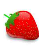
Strawberries 15¢ each