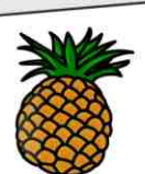
Pineapples €2.45 each