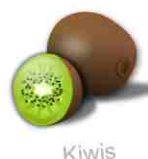
Kiwis 50¢ each