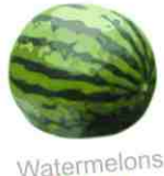
Watermelons €2.50 each