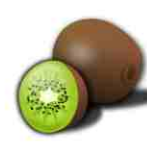
Kiwis 20¢ each