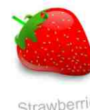
Strawberries 50¢ each