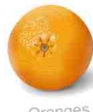
Oranges 75¢ each