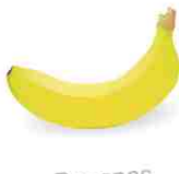
Bananas €1 each