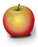
Apples 65¢ each