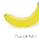
Bananas €1.50 each