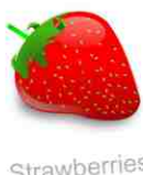
Strawberries 50¢ each