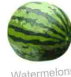
Watermelons 85¢ each