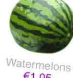
Watermelons €1.05 each