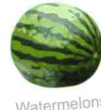
Watermelons €1.75 each