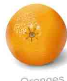
Oranges 45¢ each