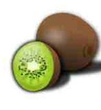
Kiwis 35¢ each