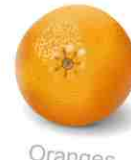
Oranges 85¢ each