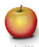
Apples 75¢ each