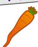
Carrots 25¢ each