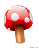
Mushrooms 15¢ each