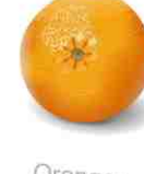
Oranges 75¢ each